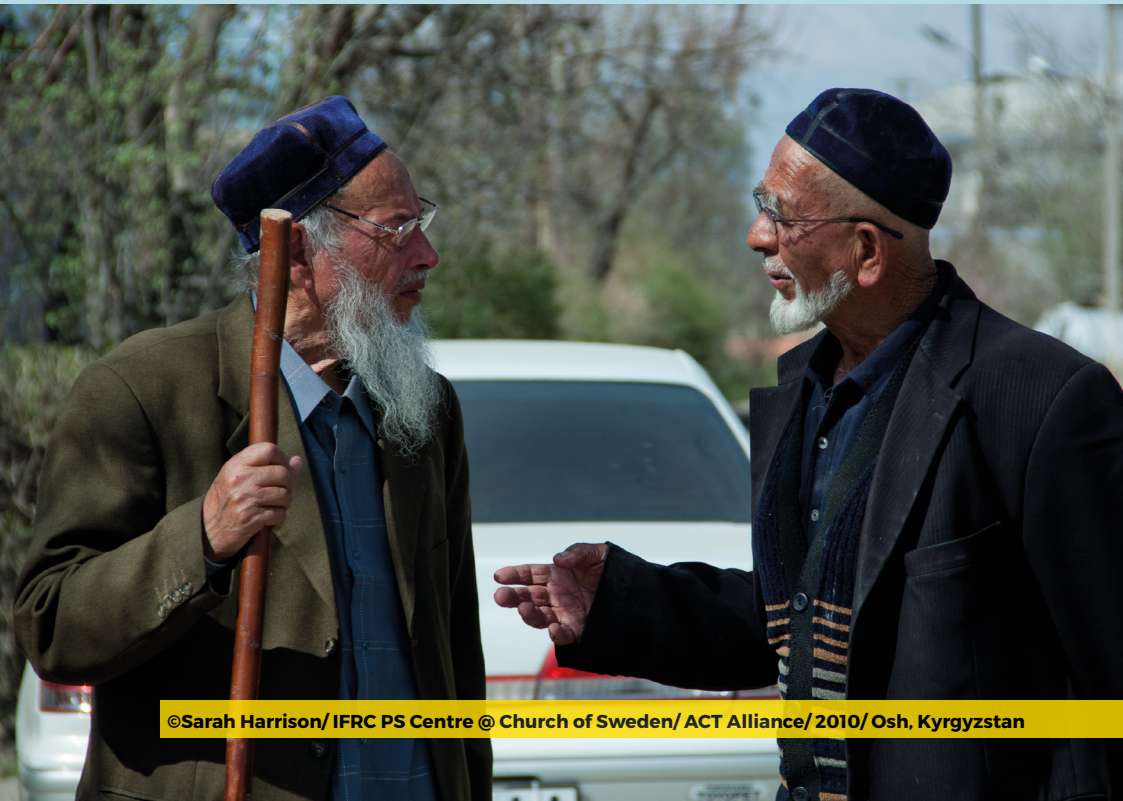
2010/ Osh, Kyrgyzstan

During quarantine, where possible, safe communication channels should be provided to reduce loneliness and psychological isolation (e.g. WeChat).